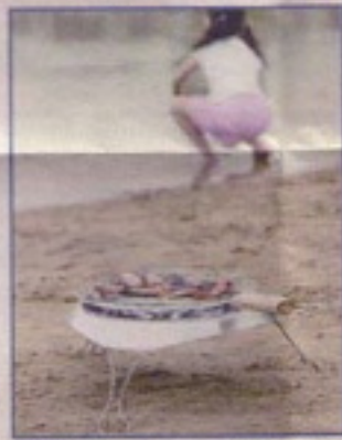
Griffon folding barbecue, £22, SCP. Tel: 020 7739 1869, www.scp.co.uk