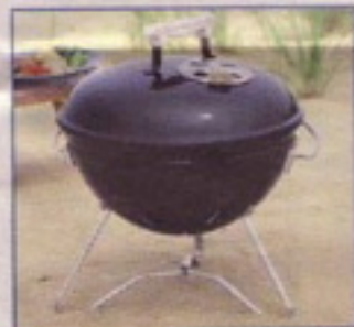
Weber Smokey Joe, £44.99. Tel: 01756 692600 for stockists, www.weber.com