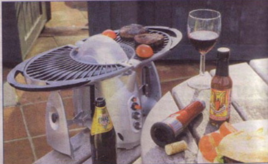
Unidentified frying object: Weber's Q barbecue (above, in cooking action and below centre, folded), £99.95. Tel: 0870 241 4289, www.firebox.com

Alternatively, John Lewis and The Conran Shop stock simple but well-designed compact models, and SCP has a great little folding number for maximum portability. Just make sure you check your local park regulations on fires...