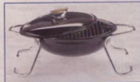
Mobile barbecue grill, £59.99, The Conran Shop. Tel: 020 7300 3464, www.conranshop.com